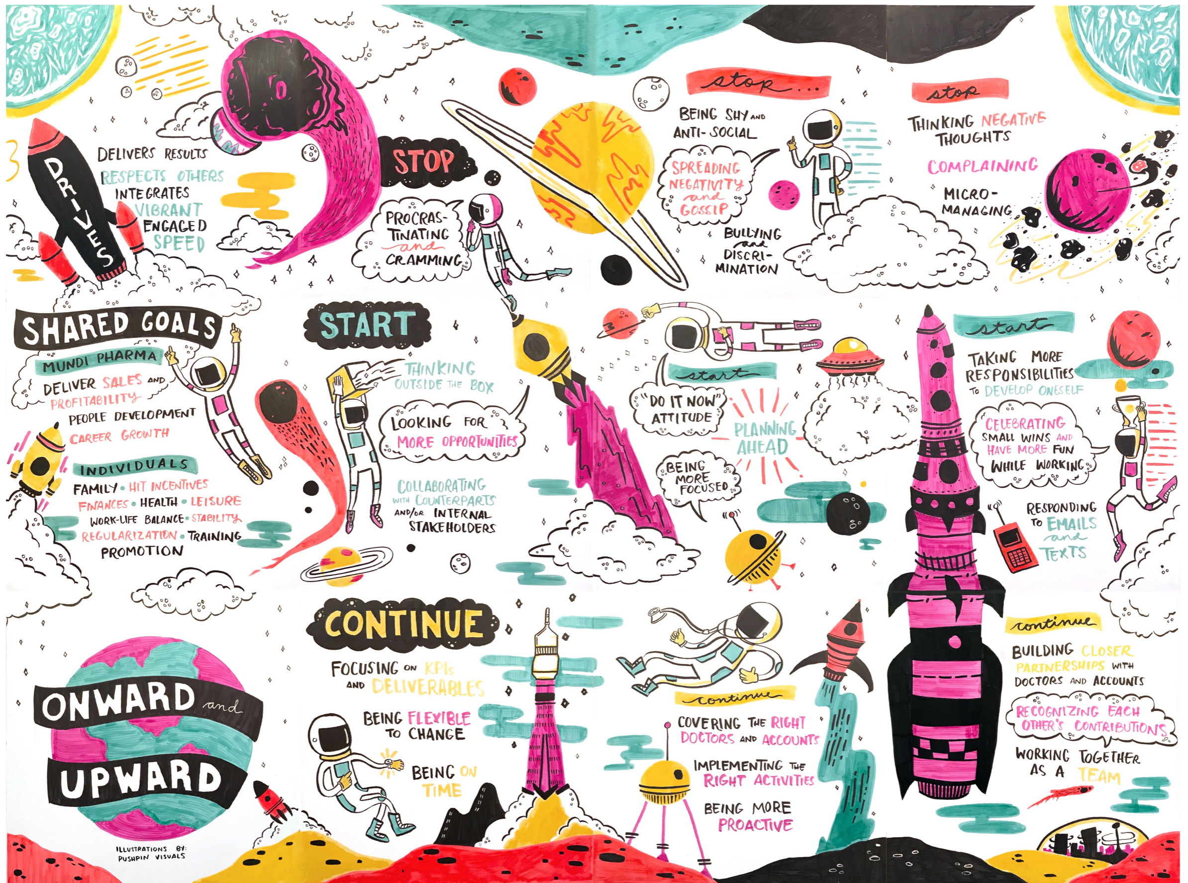
CLIENT: Mundi Pharmacy Philippines