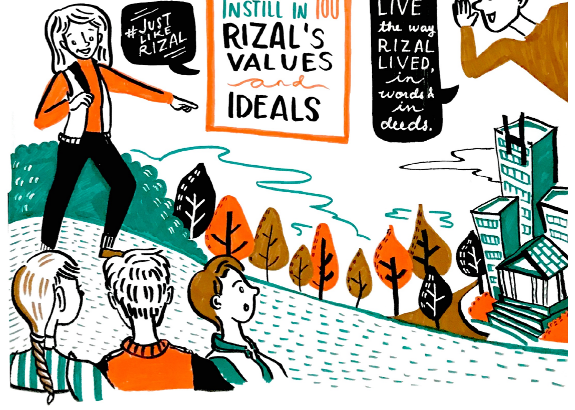
CLIENT: National Rizal Youth Leadership Camp